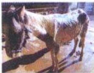
Mrs Tiggywinkle 04.03.10

Adoption homes are checked regularly and the SWHP now owns more than 270 horses and ponies, ranging from former racehorses to Shires and Shetland ponies.